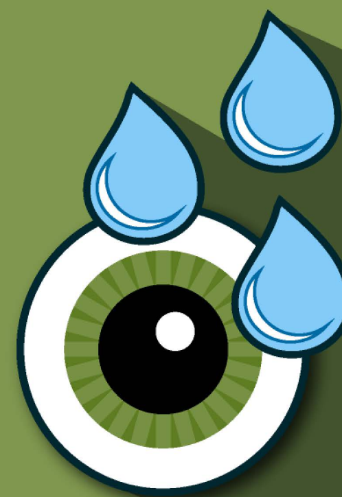
Eyewash and Safety Shower