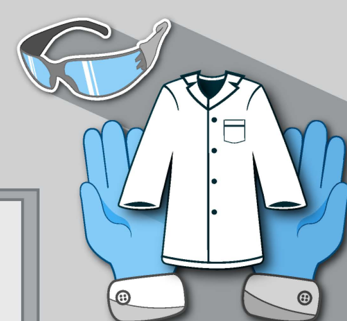
Personal Protective Equipment