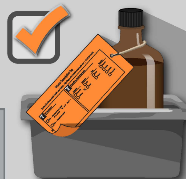
Satellite Accumulation Area