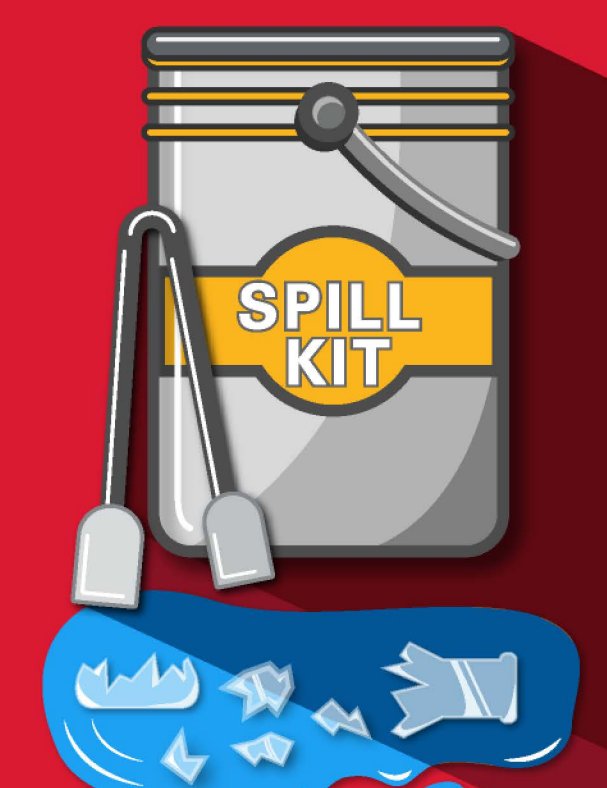
Spill Control Kit