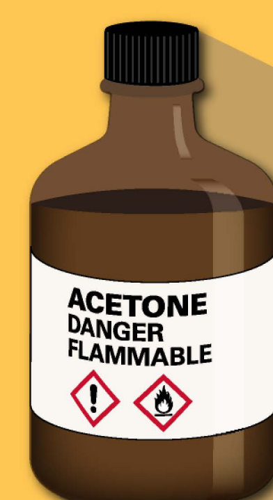
Containers Labeled and Closed