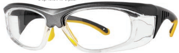
Gray/Yellow w/ Crystal