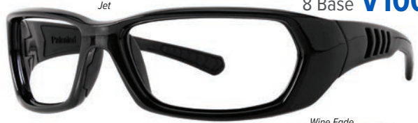
8 Base V1000