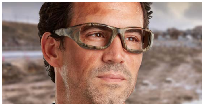
Image features ZT35 camouflage frames