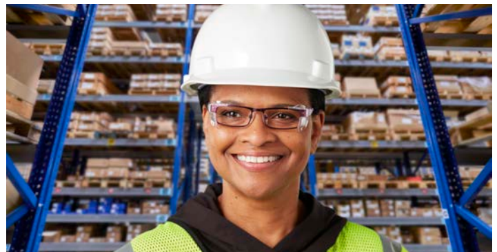
Image features Stainless Steel Attitude 6