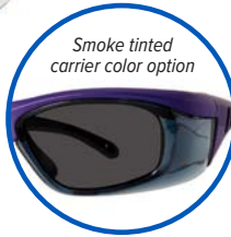
Smoke tinted carrier color option