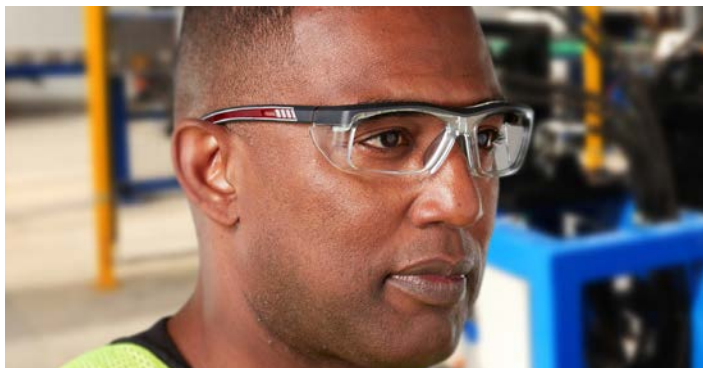
Image features ZT500 frames