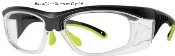
Black/Lime Green w/ Crystal