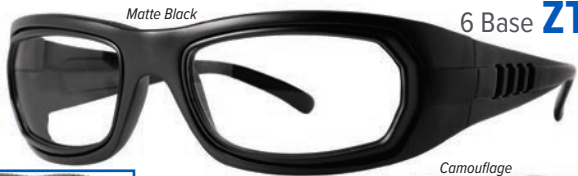
6 Base ZT25