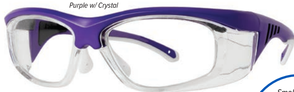
Purple w/ Crystal