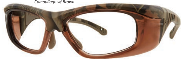
Camouflage w/ Brown