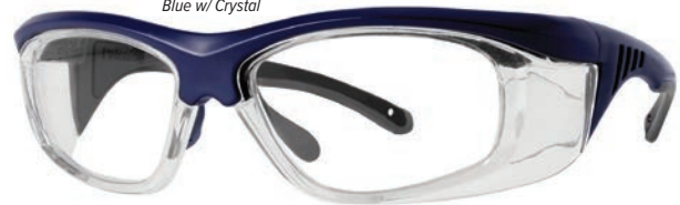
Blue w/ Crystal