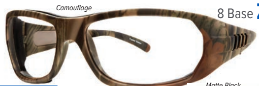
8 Base ZT25