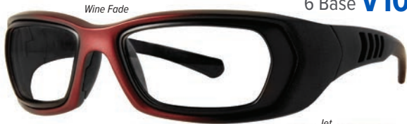
6 Base V1000