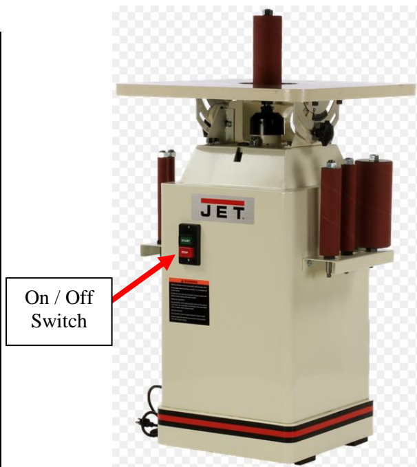
On / Off Switch