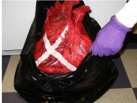
Biohazard symbol with "X"